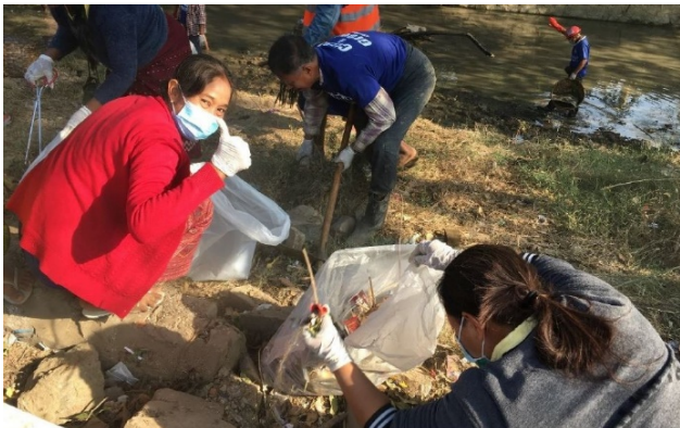
Civil society organizations, community members, businesses and government work together to rehabilitate a canal.

Through the Promoting Equitable, Accountable, Civic Engagement (PEACE) project's support, local civil society organizations expanded, strengthened, and developed more meaningful relationships with different levels of government and communities.